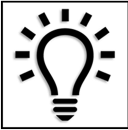
System Tips: Guided Buying vs Expert View