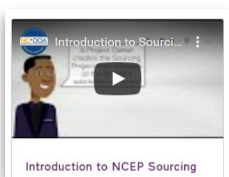
NC eProcurement Sourcing Application is Live!