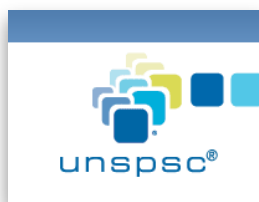
Tips and Tricks Selecting UNSPSC Commodity Codes