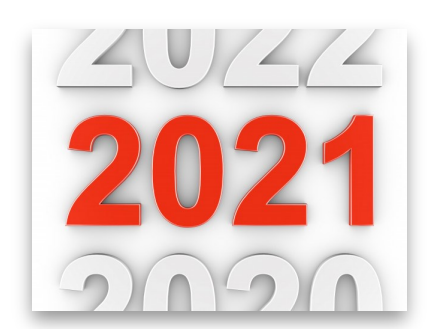
Holiday Reminder: Delegate Your Authority